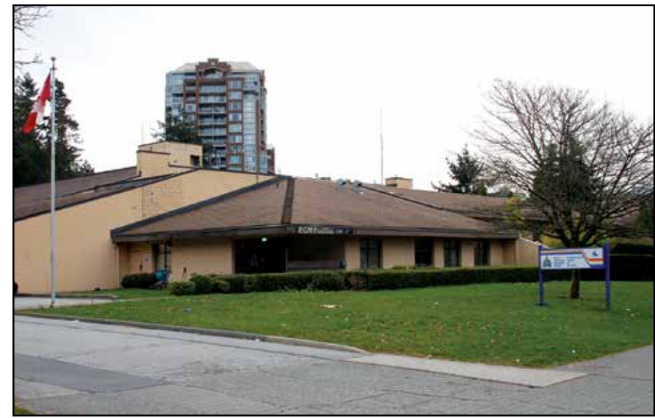
RCMP University Detachment building at 2990 Wesbrook Mall at UBC

The RCMP University Detachment serves University of British Columbia (both institutional and residential areas) and the University Endowment Lands, including Pacific Spirit Regional Park, Department of Highways and Wreck Beach.