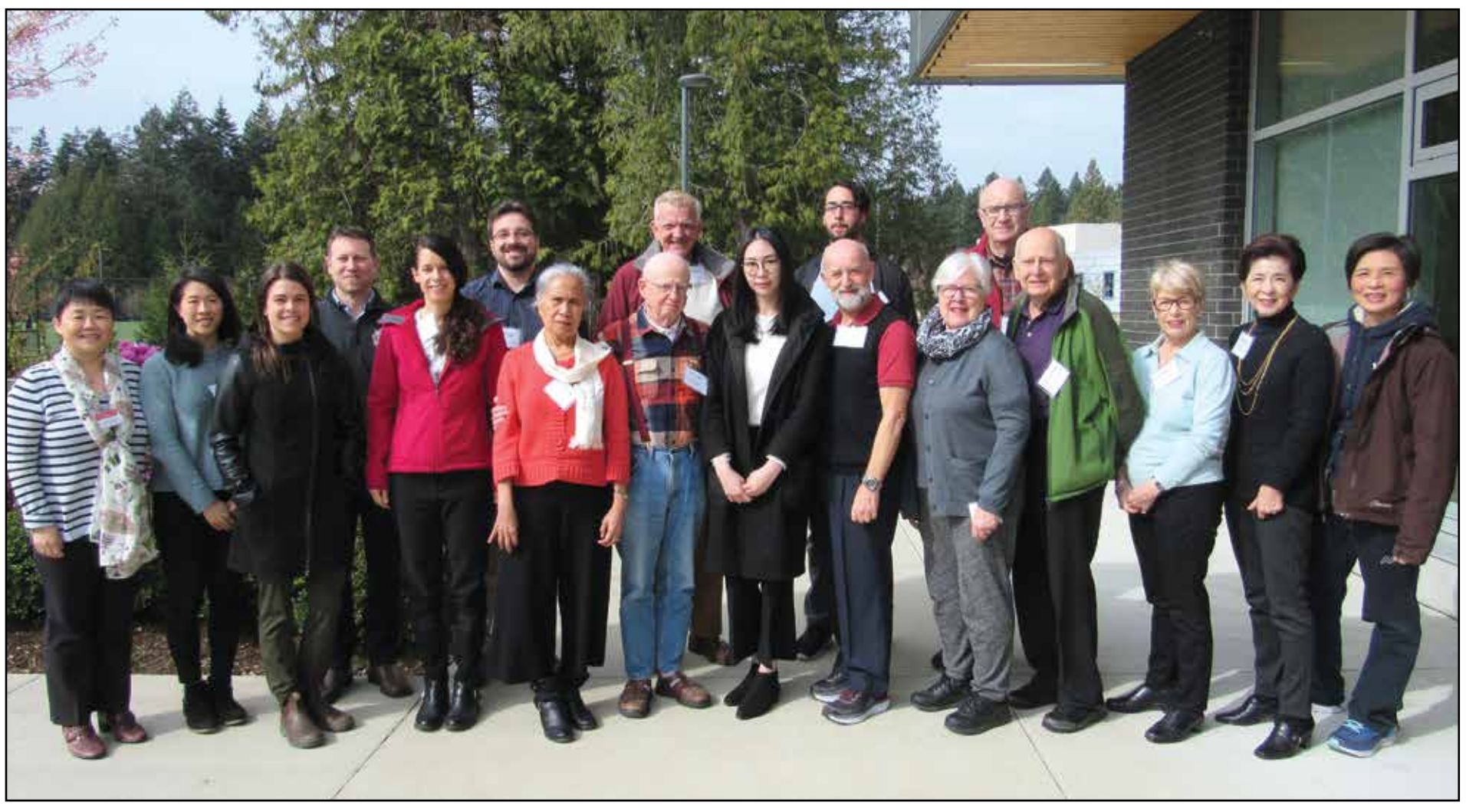
The first Your Passport to Wellbeing meeting with UNA staff, seniors, and community partners.

The UNA will be rolling out a free twelve week program designed for seniors in Fall 2018 that will boost seniors' choices for wellbeing. The project Your Passport to Wellbeing is grant- funded by Employment and Social Development Canada's New Horizons for Seniors Program. This project will be a collaboration between the UNA staff, seniors in the community, and community partners, in an effort to streamline communication and to build a stronger foundation for seniors' programming at Wesbrook and The Old Barn Community Centres.