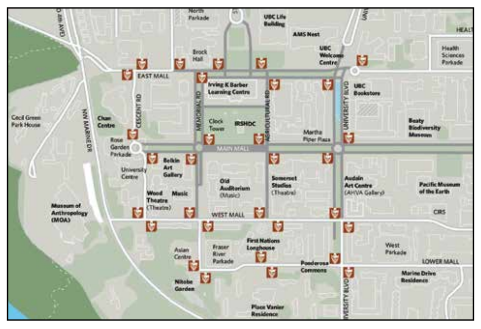
Map of the bilingual street signs on UBC campus.

šxwhakwmat refers to the way we remember the people and events that have passed before us.