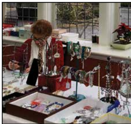
Artisan crafts and fashion accessories at the FWC Christmas Boutique.

Through the generous support of our members, the event was a great success in terms of scholarship contributions, while a wonderful time was had by all! The FWC offers a dozen different scholarships and bursaries,