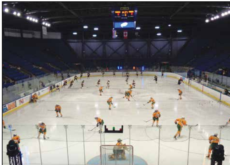
UBC Women's hockey team plays against the University of Alberta Pandas team.

The bustling UBC event also featured a festival zone – active throughout the public skate and hockey game – with fun, all-ages, winter-themed activities.