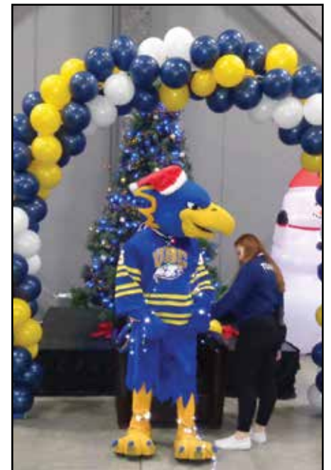
UBC mascot Thunder.