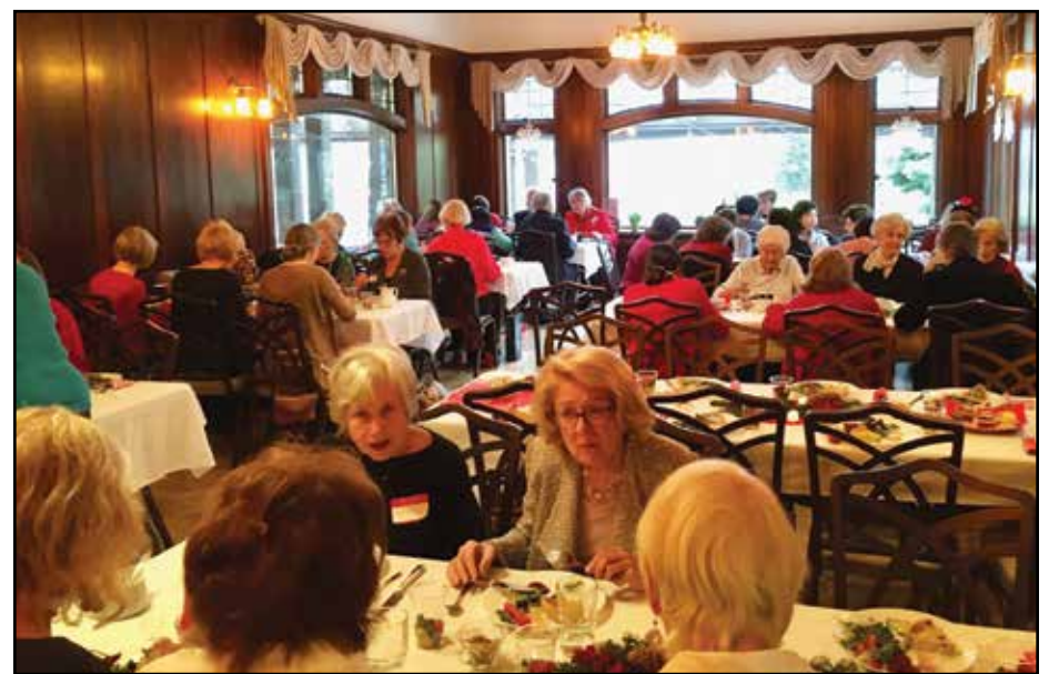
The Christmas Boutique lunch at the Faculty Women's Club at the Cecil Green Park House on UBC campus.