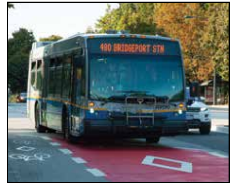
A bus drives in the red bus priority lane going South on Wesbrook Mall.