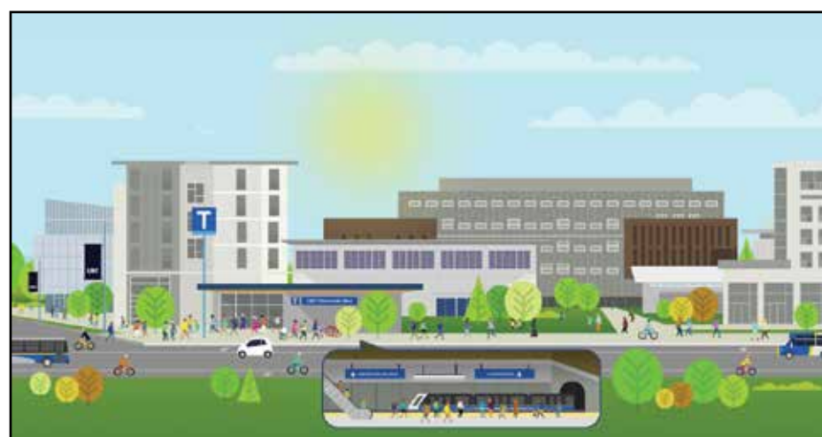
Illustration and map route of the future SkyTrain to UBC, Wesbrook Village.