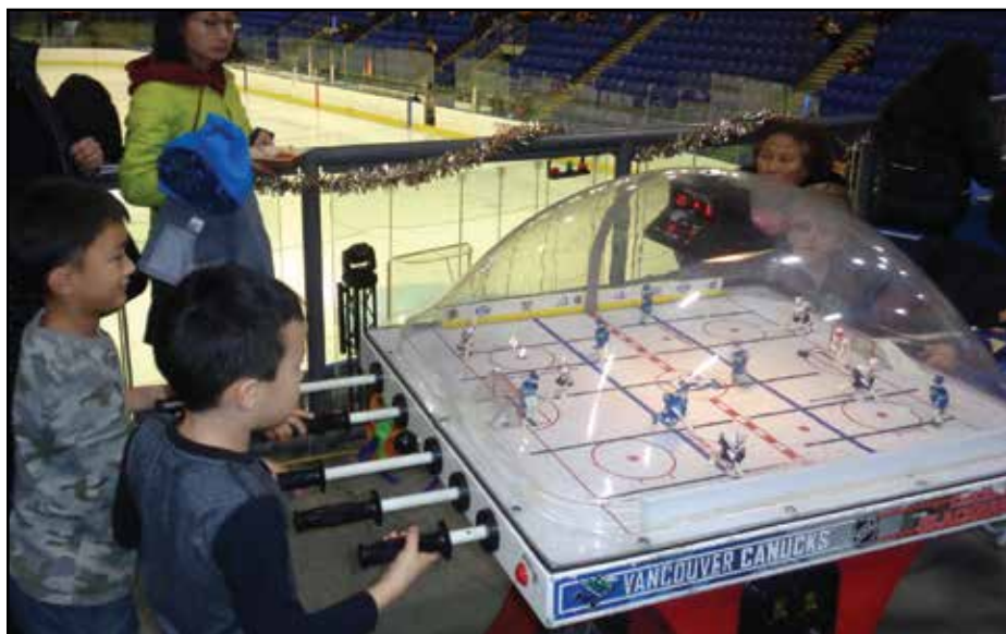
Hockey skills game in progress.