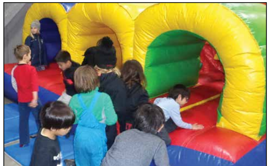
Children play at huge inflatable obstacle course.