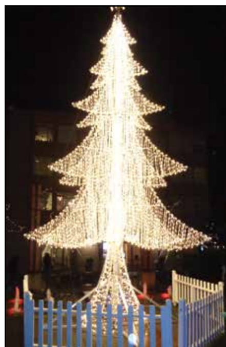
Outdoor light and 32-foot tree display in Wesbrook Village.