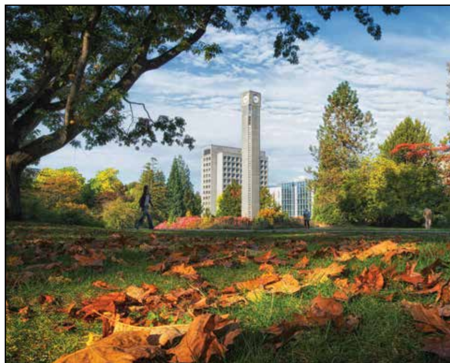
The Clocktower on UBC campus.

To move UBC to further action, with this declaration I am establishing a climate emergency community engagement process. The purpose of this consultation will be to provide the UBC community with opportunities to come together to consider the full scope of our impact and align UBC's emissions reductions plans with 1.5oC; to embrace the need for a managed decline of fossil fuel use and a rapid and just transition to a sustainable economy that also aligns with UNDRIP; to infuse climate justice throughout our activities, priorities, and decision-making frame-