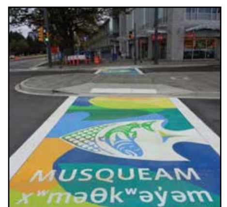
Crosswalks at the intersection of Wesbrook Mall and University Boulevard include the logos of UBC and Musqueam.

The Stadium Neighbourhood Plan completion will be considered through the Relationship Agreement with Musqueam. Analysis of residential densities and building heights continues.