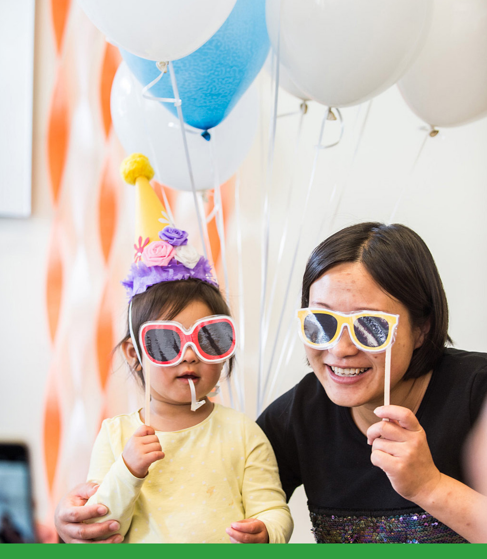
University Neighbourhoods Association, 2016