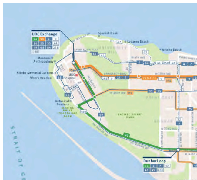
TransLink bus and RapidBus routes that service UBC peninsula

You can read more about the evolving situation at TransLink on their website : https://tripplanning.translink.ca/#/app/tripplanning